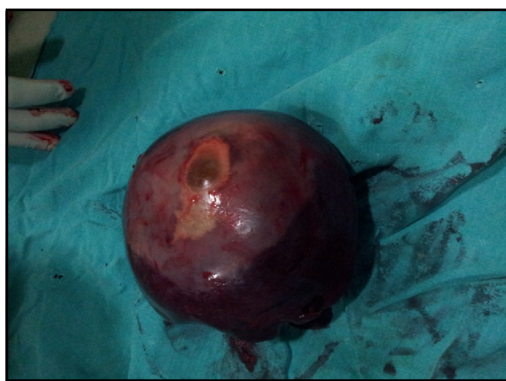
Fig.1 Intraparenchymal cyst measuring 93.1mm x 92 3mm x83.3mm with approximate volume of 378.3 cc