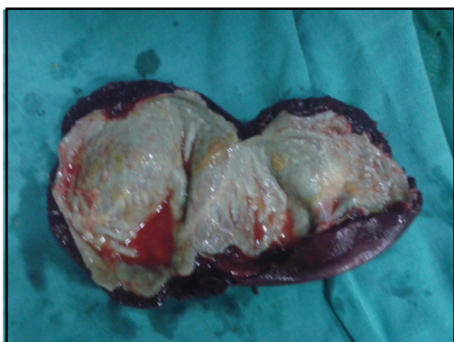
Fig.1 Intraparenchymal cyst measuring 93.1mm x 92 3mm x83.3mm with approximate volume of 378.3 cc